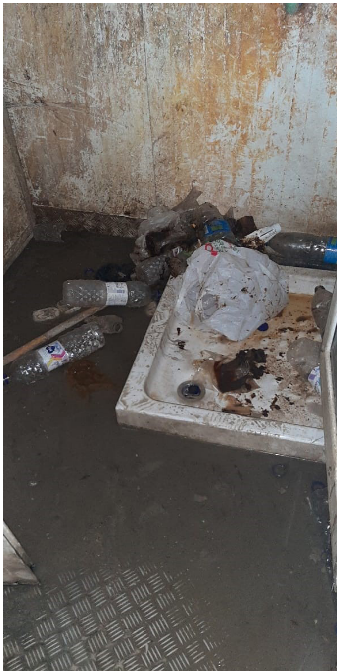
Fig. 5 & 6

Dirty and unusable Bathroom and Shower Facilities