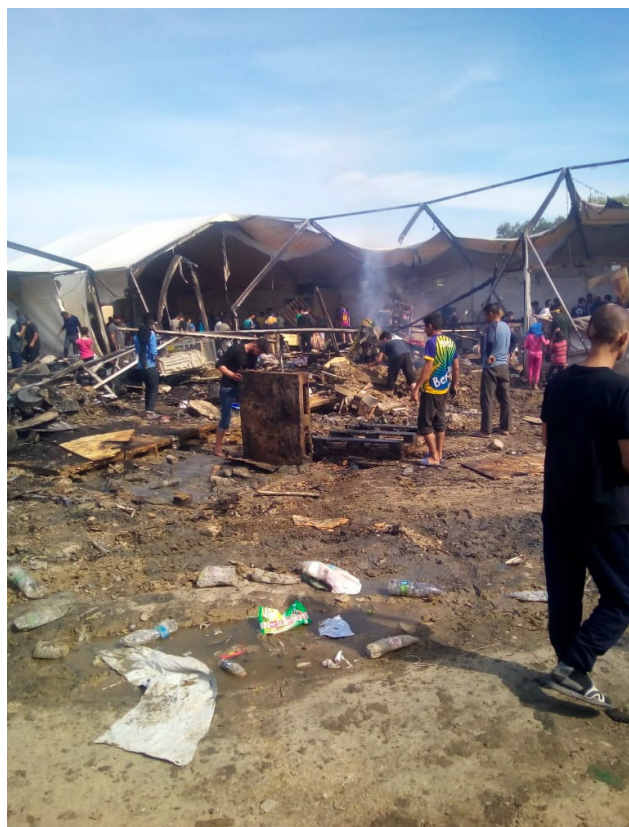
Fig. 9 & 10

potential COVID-19 outbreak in the camp would be that much more difficult to contain moving forward.