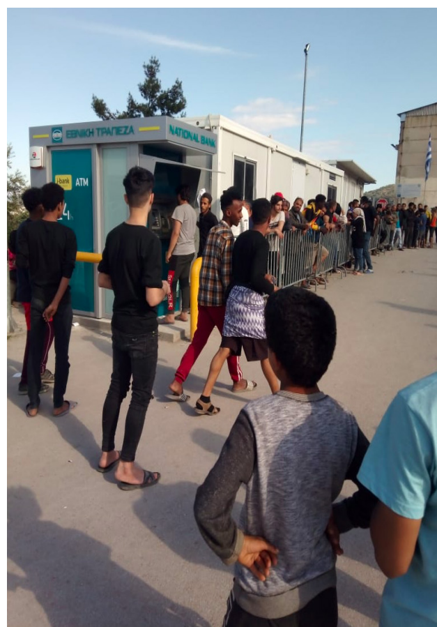
Fig. 7 & 8

No Space for Social Distancing: Crowds of People waiting for Food and other Essential Services